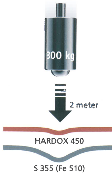
Comparison of mild steel with HARDOX 450.

In sliding wear, the higher hardness of HARDOX 450 compared to HARDOX 400 always improves the wear resistance. In favourable cases, such as if the wearing material is granite, the useful life may increase by 75%.