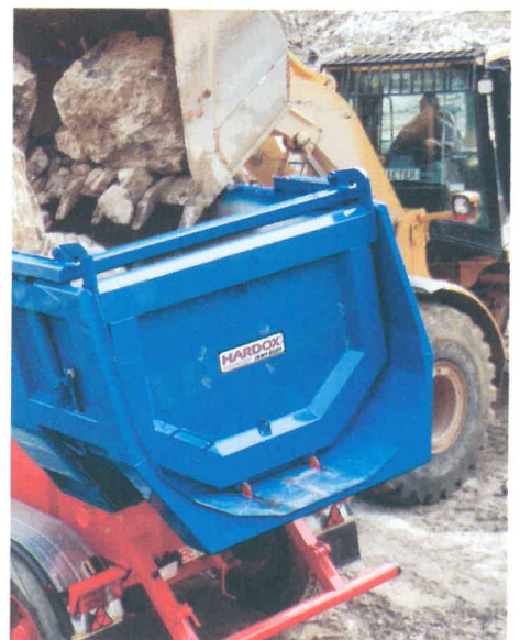
A truck body made of HARDOX wear steel is more durable due to the unique combination of hardness and toughness. Increased load-carrying capacity with unchanged weight results in better overall economy.

The “HARDOX in my body” sign is your safeguard that the body is made from high quality HARDOX wear steel. The wear resistance increases the useful life of the truck body, and the toughness makes it capable of withstanding rough handling. The result is a better overall economy due to the longer useful life and the reduced need for repairs.